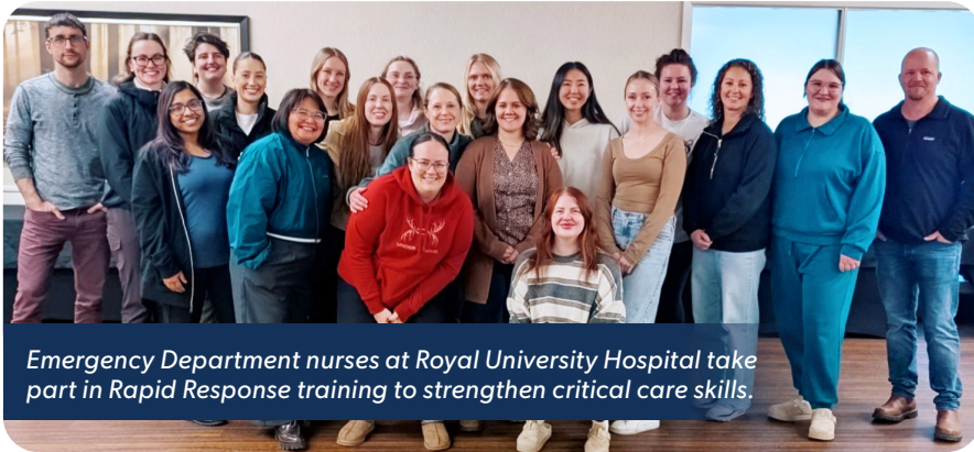
Emergency Department nurses at Royal University Hospital take part in Rapid Response training to strengthen critical care skills.

For the nurses working in Royal University Hospital's (RUH) Emergency Department, every opportunity to learn is one worth celebrating.