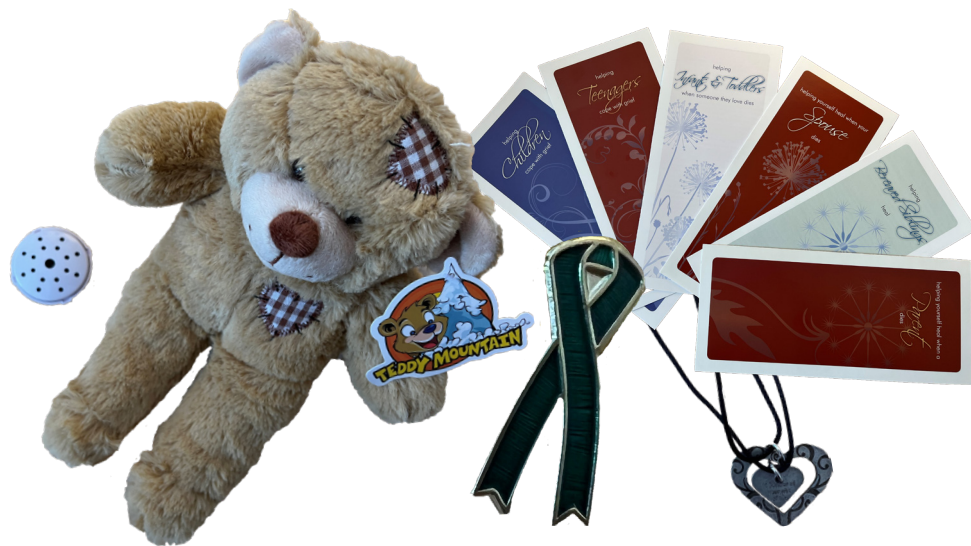
HUG Fund grants support families of patients who are organ and tissue donors at RUH providing them with special keepsakes and additional support material as they navigate this difficult time

Your generous support is having a direct and profound impact on patients and families at RUH. Thank you.