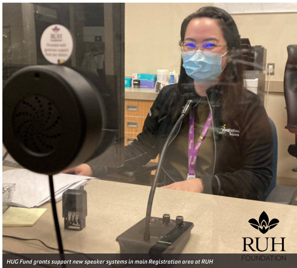
HUG Fund grants support new speaker systems in main Registration area at RUH

In addition, resource books for children and customized brochures to assist families as they move through the initial loss and the grief process will be made available.