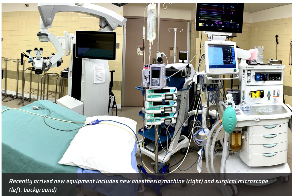
Recently arrived new equipment includes new anesthesia machine (right) and surgical microscope (left, background)

Some examples of the new state-of-the-art equipment in use today include two surgical microscopes, two spinal surgery tables, and five anesthesia machines and related monitors.