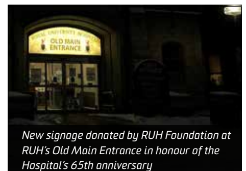
New signage donated by RUH Foundation at RUH's Old Main Entrance in honour of the Hospital's 65th anniversary